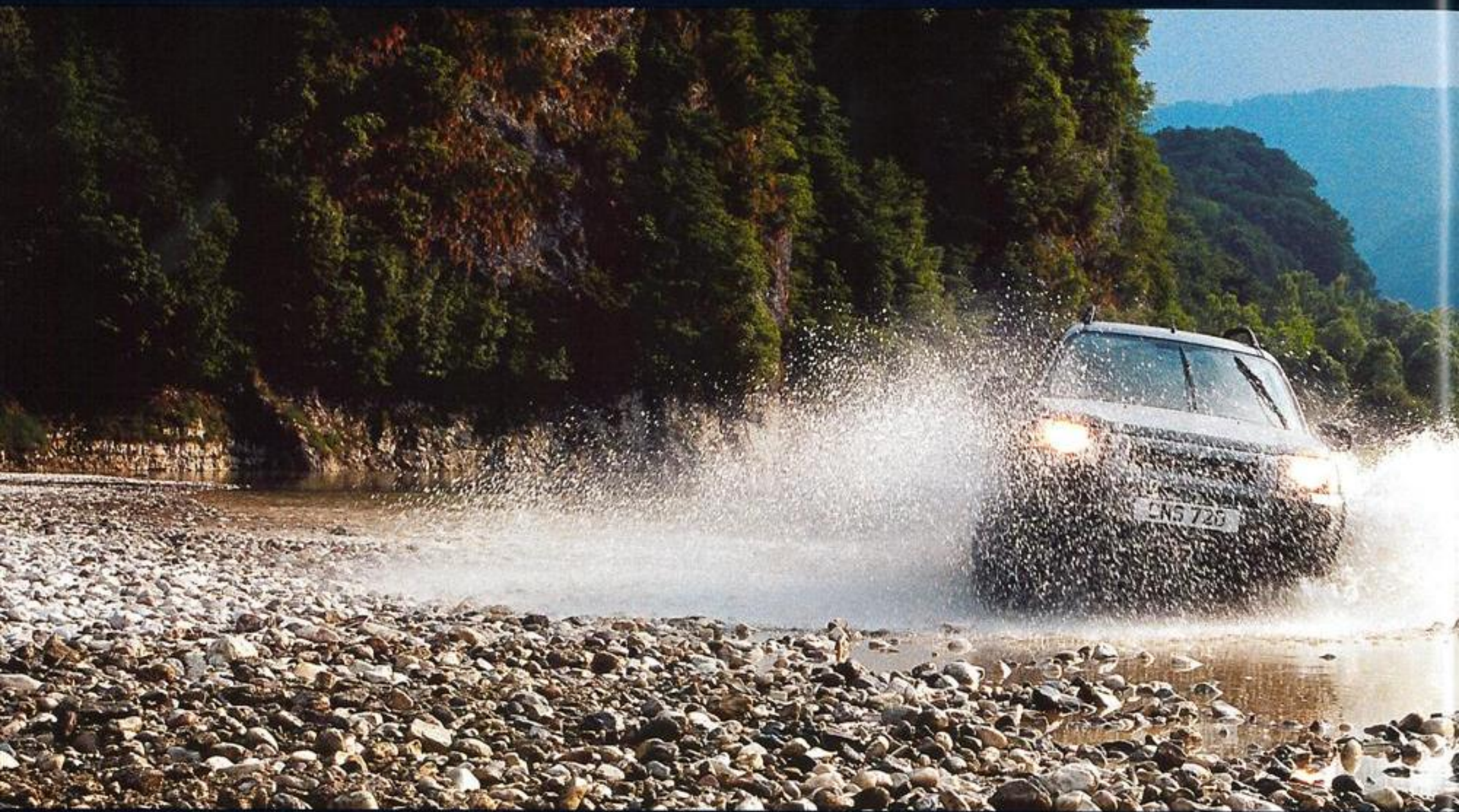
The New 2004 Freelander – built by Land Rover.