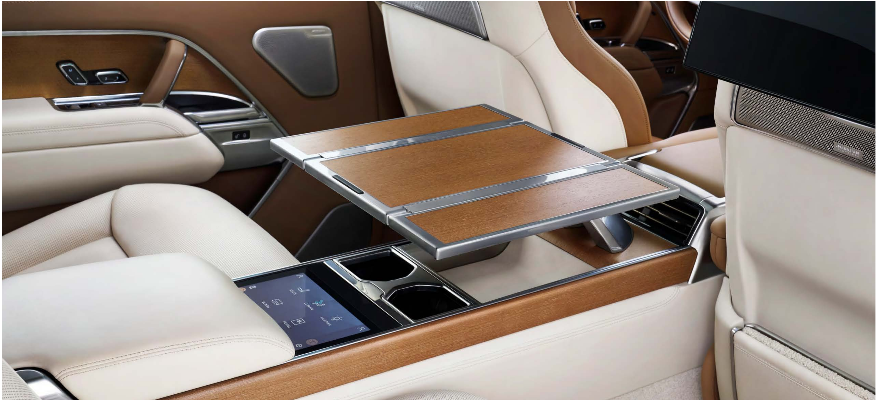
The SV Signature Suite includes a new Electrically Deployable Club Table, plus electrically deployable cupholders. It combines with a fixed full-length rear console for the ultimate in luxury.