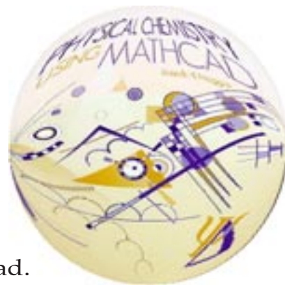
TABLE OF CONTENTS (page 8 of 9)